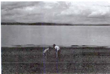
A Puget Sound beach can be a fun place to explore during low tides.

To sign up please call Polly Freeman at (206) 296-8359. Subsequent required training sessions will be in the evenings from March through May.