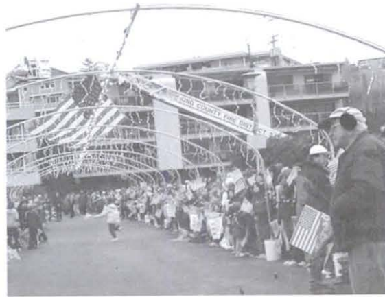
Above, the Olympic Torch arrives at the Des Moines Marina on Jan. 23 on the Shelly Foss tug boat; above right, spectators line an archway where the torch bearer will run; right, members of the Mount Rainier High School Drill Team show their patriotism.